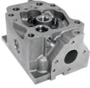
ÜRÜN ADI : SİLİNDİR KAPAĞI BOŞ PRODUCT NAME : CYLINDER HEAD (BLANK) ARAÇ ADI : MERCEDES ACTROSS EURO 3 VEHICLE ORJ. REF. NO : 541 010 6420 ORJ. REF. NO ÜRÜN NO : C54104001 PRODUCT NO