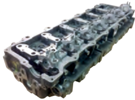
ÜRÜN ADI : SİLİNDİR KAPAĞI BOŞ PRODUCT NAME : CYLINDER HEAD (BLANK) ARAÇ ADI : MAN TGA 430 - D2066 VEHICLE ORJ. REF. NO : 51 031 006 425 ORJ. REF. NO ÜRÜN NO : C51031401 PRODUCT NO