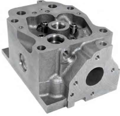
ÜRÜN ADI : SİLİNDİR KAPAĞI BOŞ PRODUCT NAME : CYLINDER HEAD (BLANK) ARAÇ ADI : MERCEDES ACTROSS EURO 5 VEHICLE ORJ. REF. NO : 541 010 4621 ORJ. REF. NO ÜRÜN NO : C54105001 PRODUCT NO