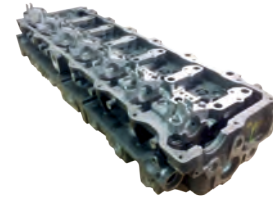
ÜRÜN ADI : SİLİNDİR KAPAĞI DOLU / SUPAPLI PRODUCT NAME : CYLINDER HEAD WITH VALVE (FULL) ARAÇ ADI : MAN TGA 430 - D2066 VEHICLE ORJ. REF. NO : 51 031 006 425 ORJ. REF. NO ÜRÜN NO : C51031402 PRODUCT NO