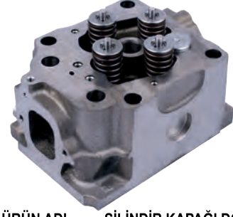
ÜRÜN ADI : SİLİNDİR KAPAĞI DOLU / SUPAPLI PRODUCT NAME : CYLINDER HEAD WITH VALVE (FULL) ARAÇ ADI : MERCEDES ACTROSS EURO 3 VEHICLE ORJ. REF. NO : 541 010 6420 ORJ. REF. NO ÜRÜN NO : C54104002 PRODUCT NO