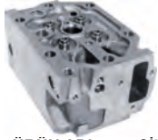
ÜRÜN ADI : SİLİNDİR KAPAĞI BOŞ PRODUCT NAME : CYLINDER HEAD (BLANK) ARAÇ ADI : MAN TGA 410 VEHICLE ORJ. REF. NO : 51 031 006 053 ORJ. REF. NO ÜRÜN NO : C51031102 PRODUCT NO