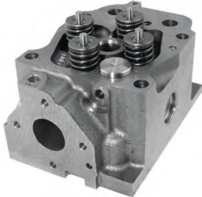
ÜRÜN ADI : SİLİNDİR KAPAĞI DOLU / SUPAPLI PRODUCT NAME : CYLINDER HEAD WITH VALVE (FULL) ARAÇ ADI : MERCEDES 1840 EURO 5 VEHICLE ORJ. REF. NO : 457 010 0721 ORJ. REF. NO ÜRÜN NO : C45702002 PRODUCT NO