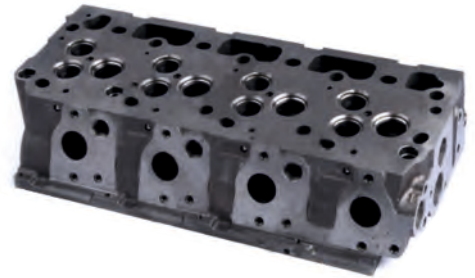
ÜRÜN ADI : SİLİNDİR KAPAĞI DOLU / SUPAPLI PRODUCT NAME : CYLINDER HEAD WITH VALVE (FULL) ARAÇ ADI : MERCEDES ATEGO OM-904 VEHICLE ORJ. REF. NO : 904 010 3521 ORJ. REF. NO ÜRÜN NO : C90406002 PRODUCT NO