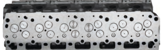
ÜRÜN ADI : SİLİNDİR KAPAĞI DOLU / SUPAPLI PRODUCT NAME : CYLINDER HEAD WITH VALVE (FULL) ARAÇ ADI : MERCEDES 3228 VEHICLE ORJ. REF. NO : 906 010 7621 ORJ. REF. NO ÜRÜN NO : C90603002 PRODUCT NO