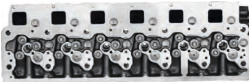
ÜRÜN ADI : SİLİNDİR KAPAĞI BOŞ PRODUCT NAME : CYLINDER HEAD (BLANK) ARAÇ ADI : MERCEDES 3228 VEHICLE ORJ. REF. NO : 906 010 7621 ORJ. REF. NO ÜRÜN NO : C90603001 PRODUCT NO