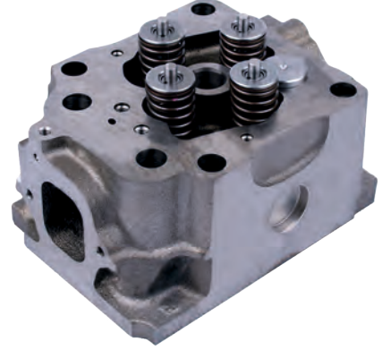
ÜRÜN ADI : SİLİNDİR KAPAĞI DOLU / SUPAPLI PRODUCT NAME : CYLINDER HEAD WITH VALVE (FULL) ARAÇ ADI : MERCEDES ACTROSS EURO 5 VEHICLE ORJ. REF. NO : 541 010 4621 ORJ. REF. NO ÜRÜN NO : C54105002 PRODUCT NO