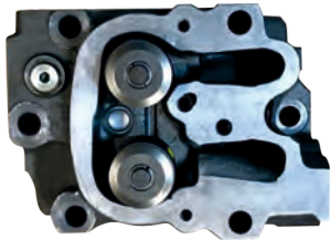
ÜRÜN ADI : SİLİNDİR KAPAĞI BOŞ PRODUCT NAME : CYLINDER HEAD (BLANK) ARAÇ ADI : MAN 19.422 VEHICLE ORJ. REF. NO : 51 031 016 585 ORJ. REF. NO ÜRÜN NO : C51031301 PRODUCT NO