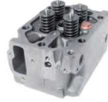
ÜRÜN ADI : SİLİNDİR KAPAĞI DOLU / SUPAPLI PRODUCT NAME : CYLINDER HEAD WITH VALVE (FULL) ARAÇ ADI : MAN TGA 410 VEHICLE ORJ. REF. NO : 51 031 006 053 ORJ. REF. NO ÜRÜN NO : C51031102 PRODUCT NO