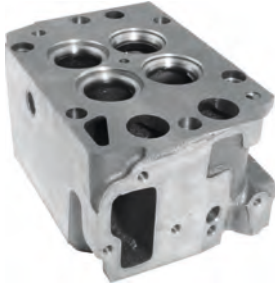
ÜRÜN ADI : SİLİNDİR KAPAĞI BOŞ PRODUCT NAME : CYLINDER HEAD (BLANK) ARAÇ ADI : MAN TGA 480 VEHICLE ORJ. REF. NO : 51 031 006 181 ORJ. REF. NO ÜRÜN NO : C51031201 PRODUCT NO