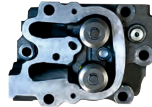
ÜRÜN ADI : SİLİNDİR KAPAĞI DOLU / SUPAPLI PRODUCT NAME : CYLINDER HEAD WITH VALVE (FULL) ARAÇ ADI : MAN 19.422 VEHICLE ORJ. REF. NO : 51 031 016 585 ORJ. REF. NO ÜRÜN NO : C51031302 PRODUCT NO