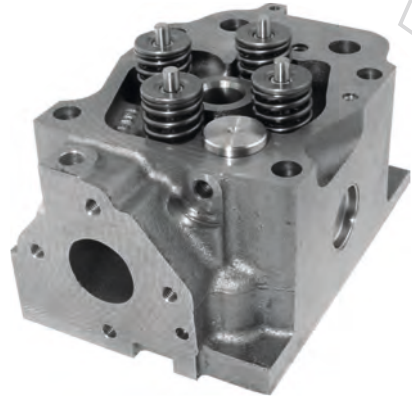
ÜRÜN ADI : SİLİNDİR KAPAĞI DOLU / SUPAPLI PRODUCT NAME : CYLINDER HEAD WITH VALVE (FULL) ARAÇ ADI : MERCEDES 1840 EURO 3 VEHICLE ORJ. REF. NO : 457 010 9620 ORJ. REF. NO ÜRÜN NO : C45701002 PRODUCT NO