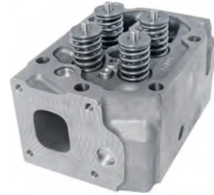
ÜRÜN ADI : SİLİNDİR KAPAĞI DOLU / SUPAPLI PRODUCT NAME : CYLINDER HEAD WITH VALVE (FULL) ARAÇ ADI : MAN TGA 480 VEHICLE ORJ. REF. NO : 51 031 006 181 ORJ. REF. NO ÜRÜN NO : C51031202 PRODUCT NO