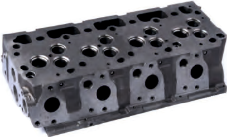
ÜRÜN ADI : SİLİNDİR KAPAĞI BOŞ PRODUCT NAME : CYLINDER HEAD (BLANK) ARAÇ ADI : MERCEDES ATEGO OM-904 VEHICLE ORJ. REF. NO : 904 010 3521 ORJ. REF. NO ÜRÜN NO : C90406001 PRODUCT NO