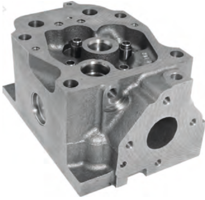
ÜRÜN ADI : SİLİNDİR KAPAĞI BOŞ PRODUCT NAME : CYLINDER HEAD (BLANK) ARAÇ ADI : MERCEDES 1840 EURO 3 VEHICLE ORJ. REF. NO : 457 010 9620 ORJ. REF. NO ÜRÜN NO : C45701001 PRODUCT NO